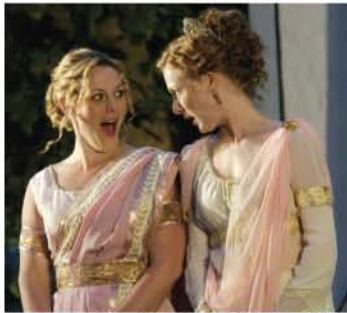
The Merchant of Venice, 2007