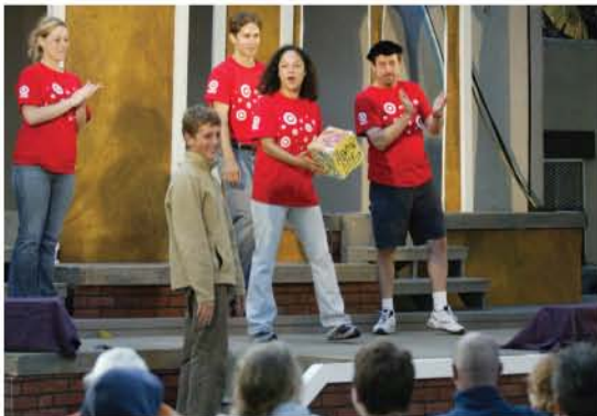
2007 Preshow sponsored by Target